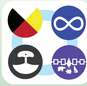
Figure 1 Using easy to see visuals in addition to verbally asked guestions can help send the message that voluntary self-ID is a standard procedure and a helpful way to access Indigenous specific supports and resources at your organization

people doing intake into services should ask everyone if they wish to self-identify. Those that do respond positively, may then be given the opportunity to further define themselves as First Nation, Métis, or